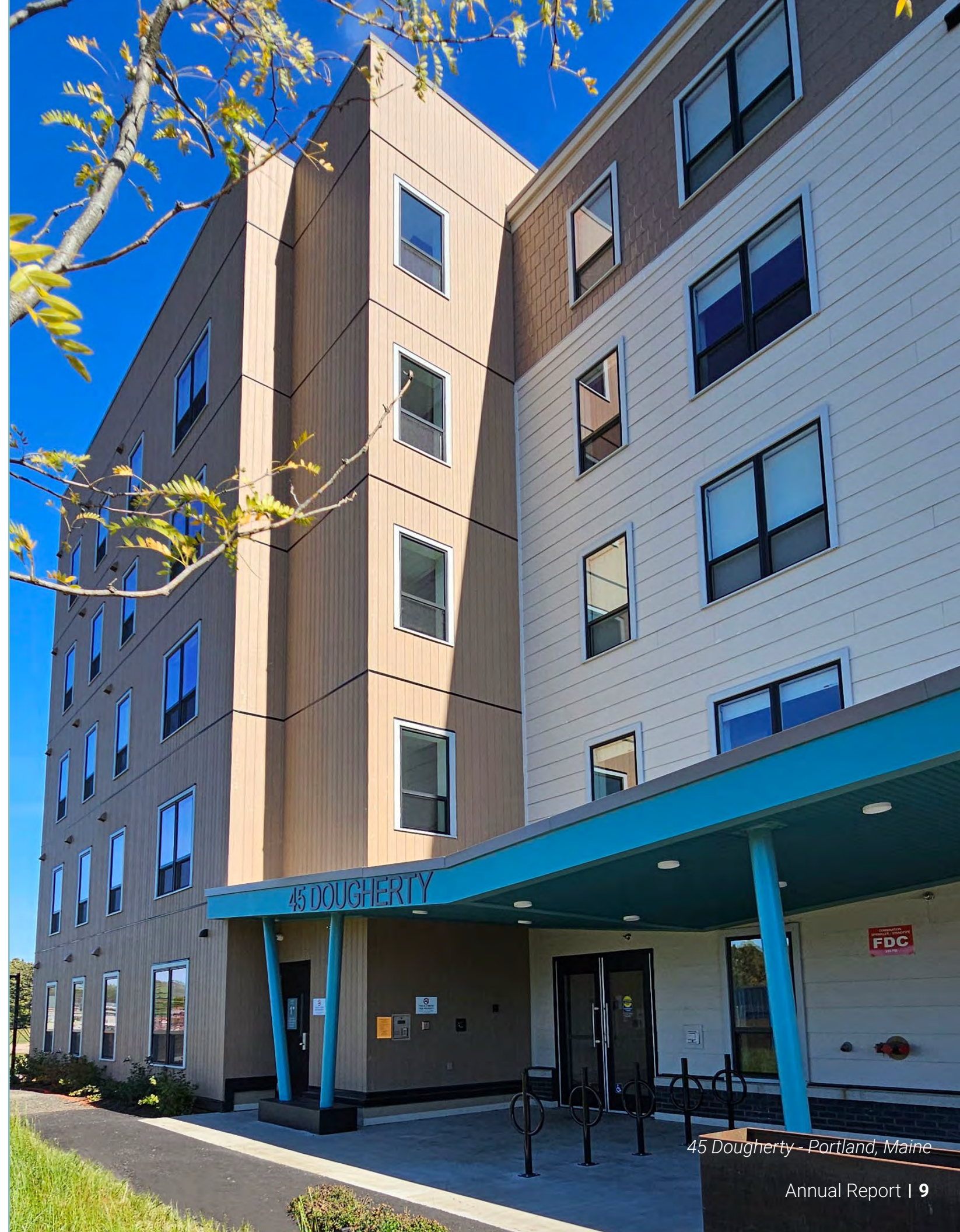
45 Dougherty - Portland, Maine