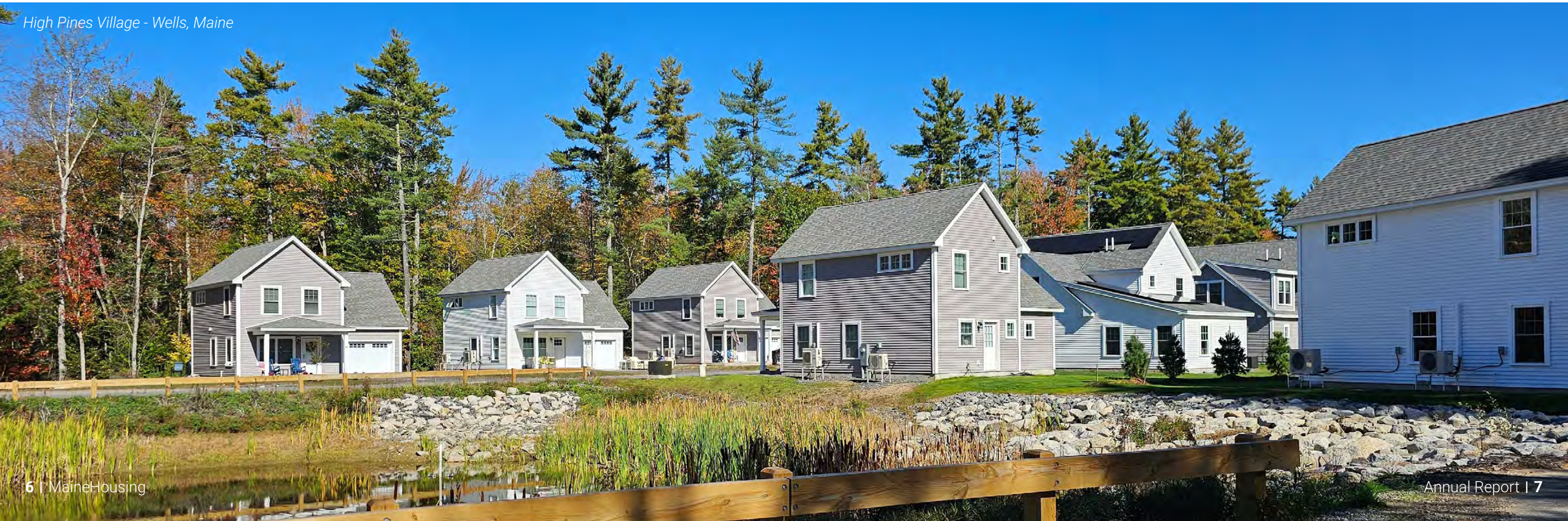
High Pines Village - Wells, Maine

Beyond stand-alone houses, the program now includes condominium and townhouse developments. In some instances, both stand-alone homes and multi-home buildings are integrated into the site. This flexibility accommodates residences priced for various income levels and the diverse lifestyles of new owners, while enhancing design adaptability for incorporating new ownership homes into existing neighborhoods.