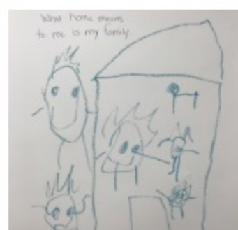
"What home means to me is my family."

Heartwarming, humorous, and poignant in only the way toddlers can be, Head Start families truly showed us what home means to them. Here are a few examples of what home means to Maine families.