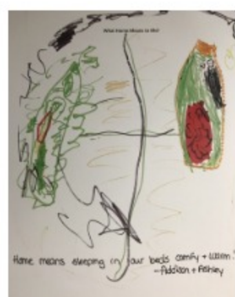
"Home means sleeping in our beds comfy & warm." - Addison & Ashley