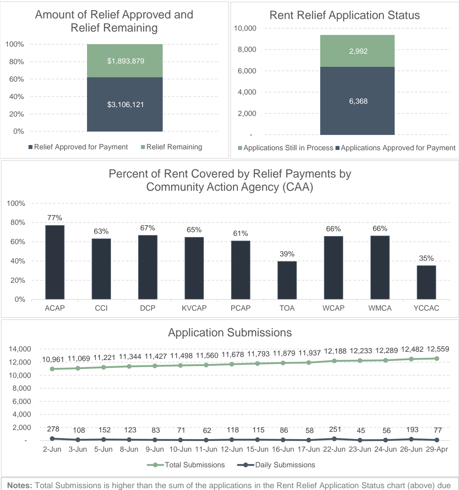
to duplicates and other ineligible submissions.