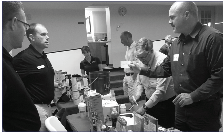
Lowes representatives talk to landlords at our May outreach event.

Both these programs provide support beyond what we are able to offer through our HCV staff, who have significantly higher caseloads. However, we are in the process of implementing an exciting new approach to case management with our staff here at MaineHousing. With the assistance of consultants from the University of Southern Maine, we have developed a new model in which staff will be trained to assess new HCV participants and to provide a greater level of support to those participants who are identified as needing more assistance to maintain